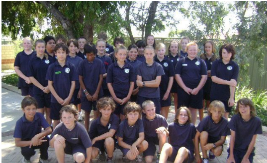
Our Year 7, C16 Class on Assembly Day