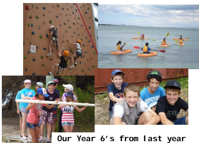
Our Year 6's from last year enjoying team building and leadership activities.