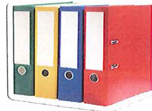
Paper-based Learning Materials