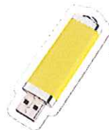
USB Flash Drives

The Australian Government is helping with the cost of educating your kids.