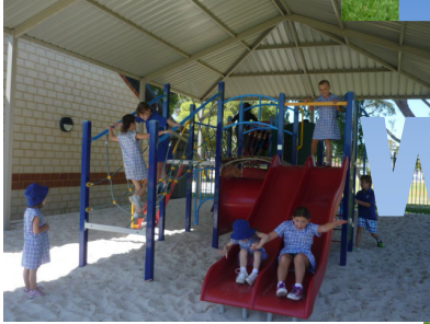
Pre Primary Area Greet and Meet